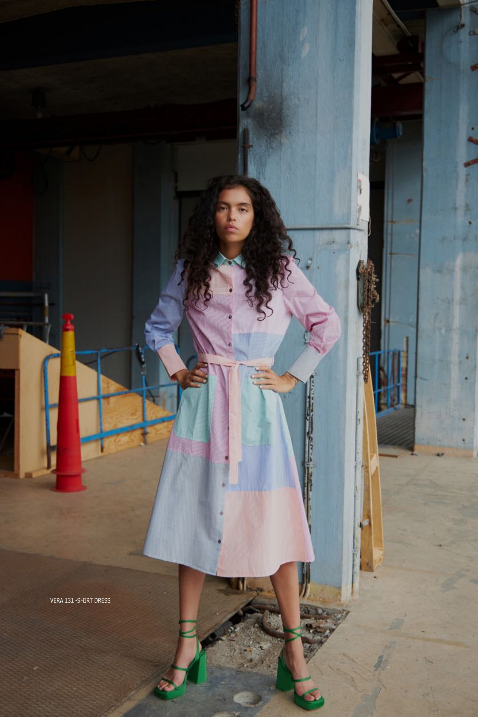
VERA 131 - SHIRT DRESS