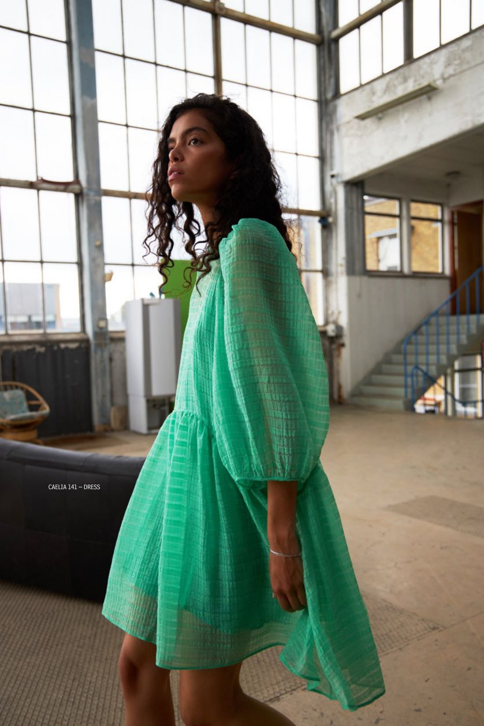
CAELIA 141 – DRESS