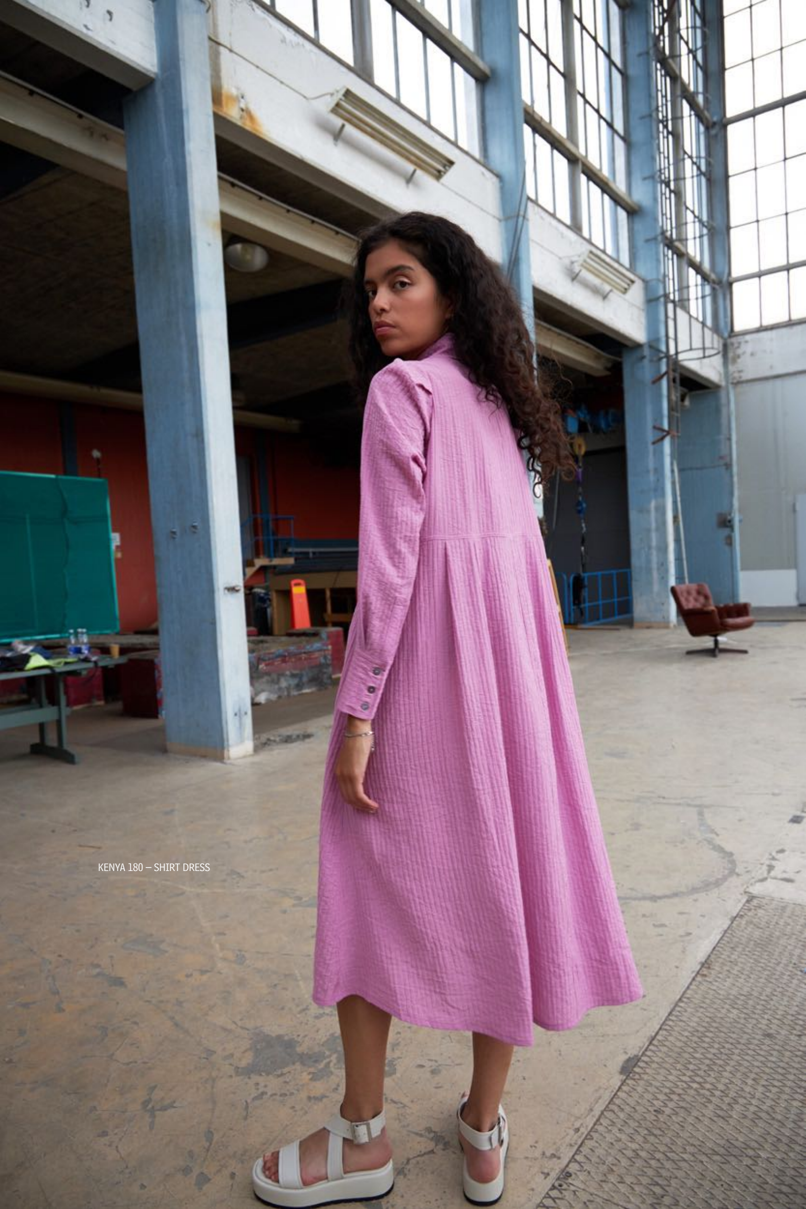
KENYA 180 – SHIRT DRESS