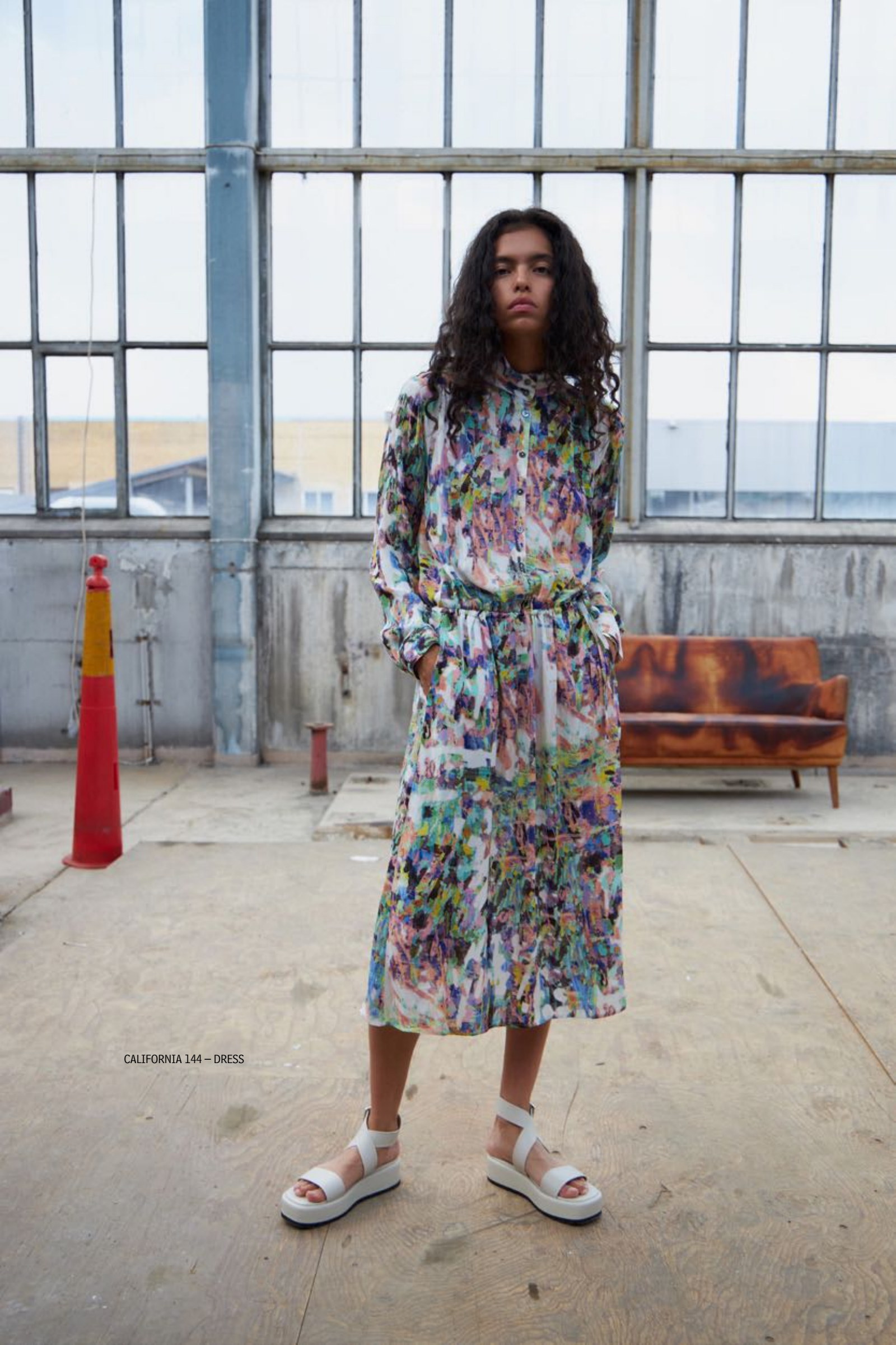
CALIFORNIA 144 – DRESS