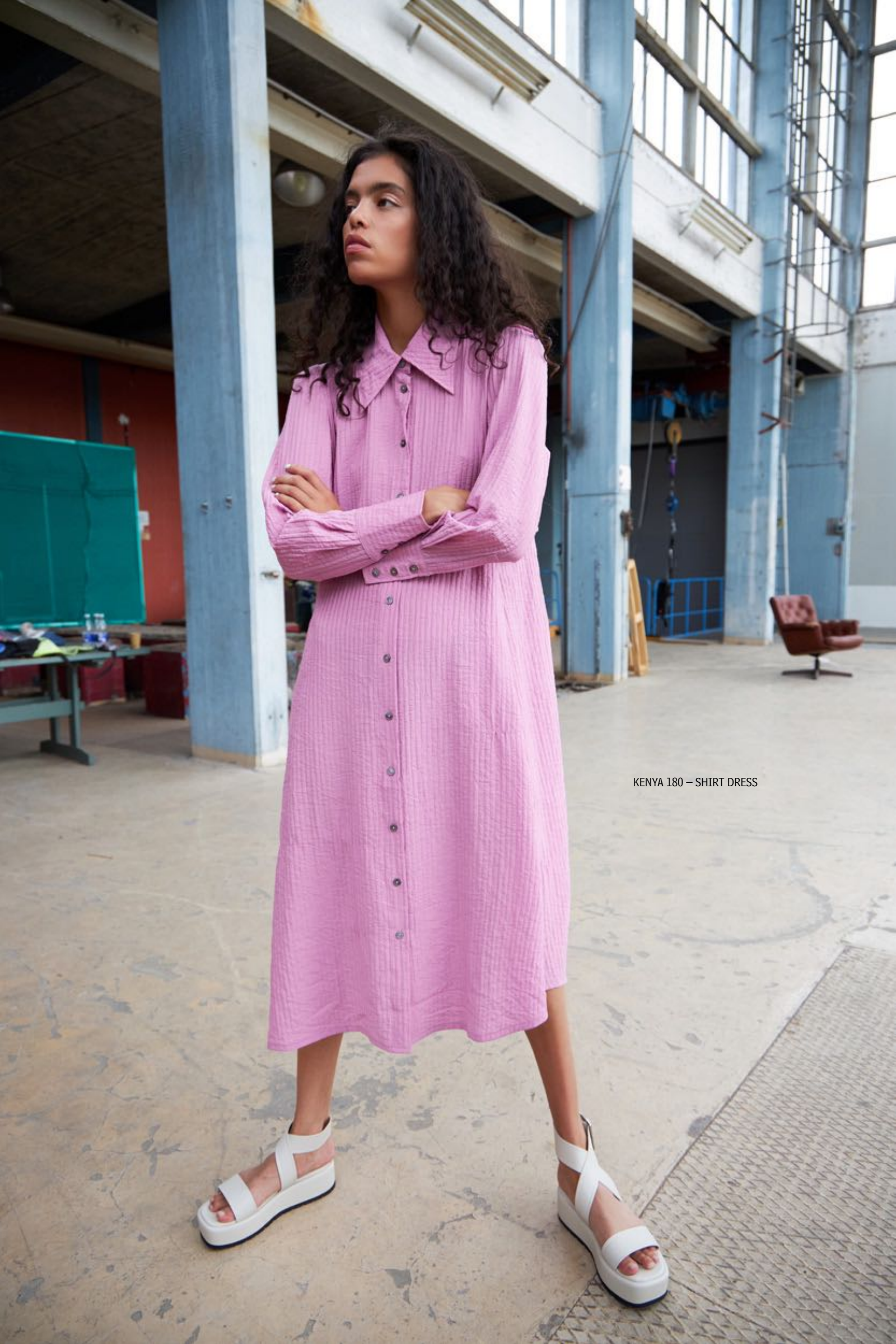
KENYA 180 – SHIRT DRESS