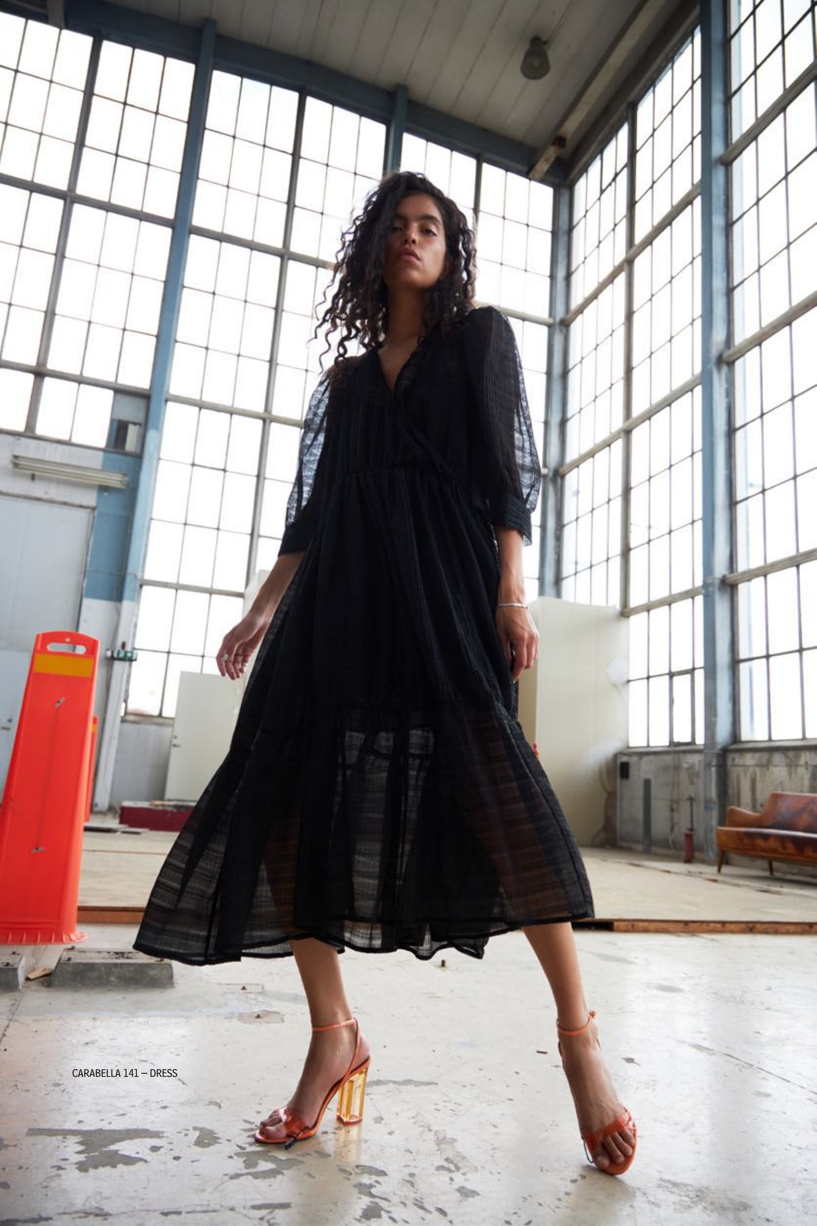
CARABELLA 141 – DRESS