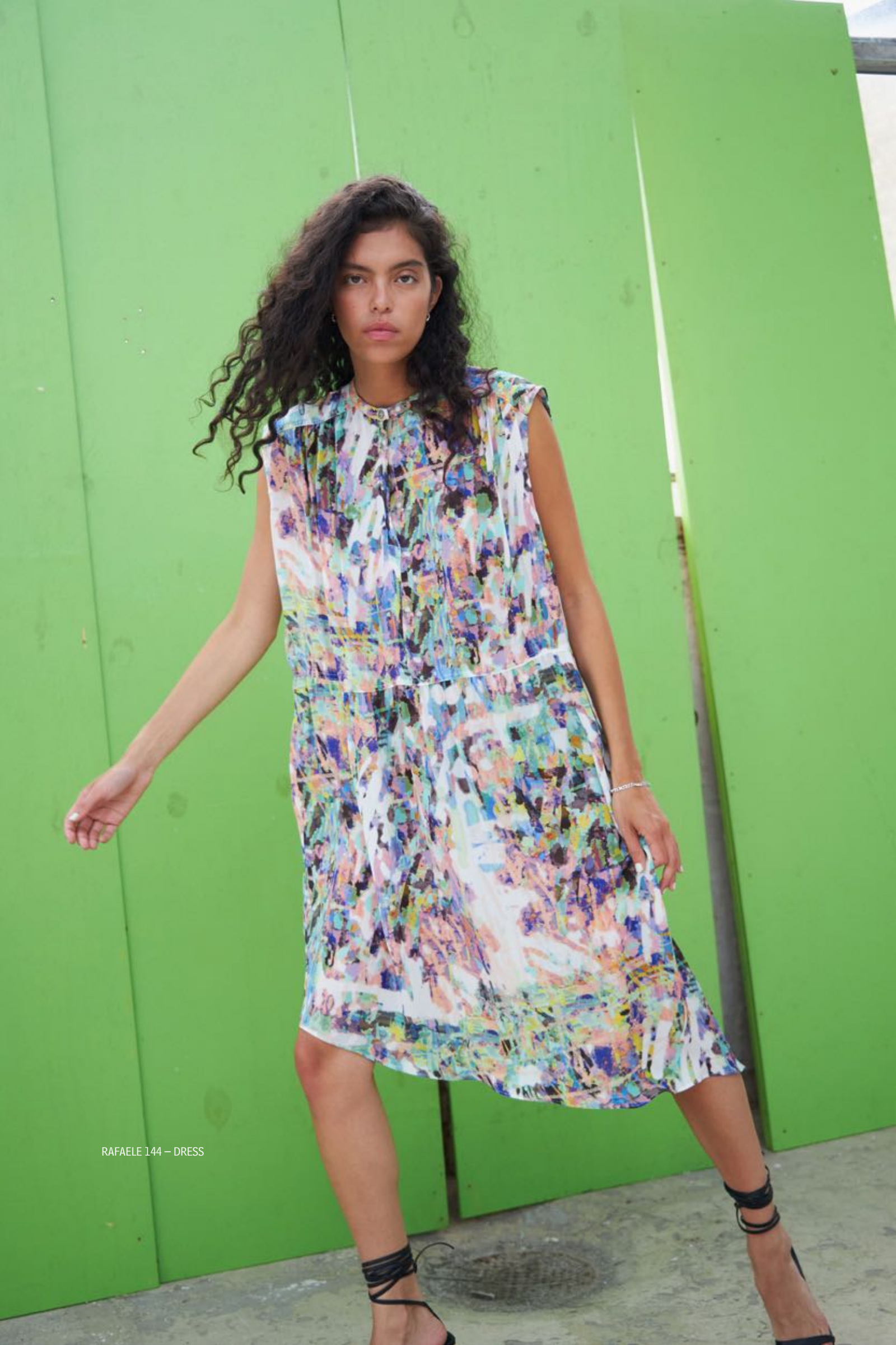
RAFAELE 144 – DRESS