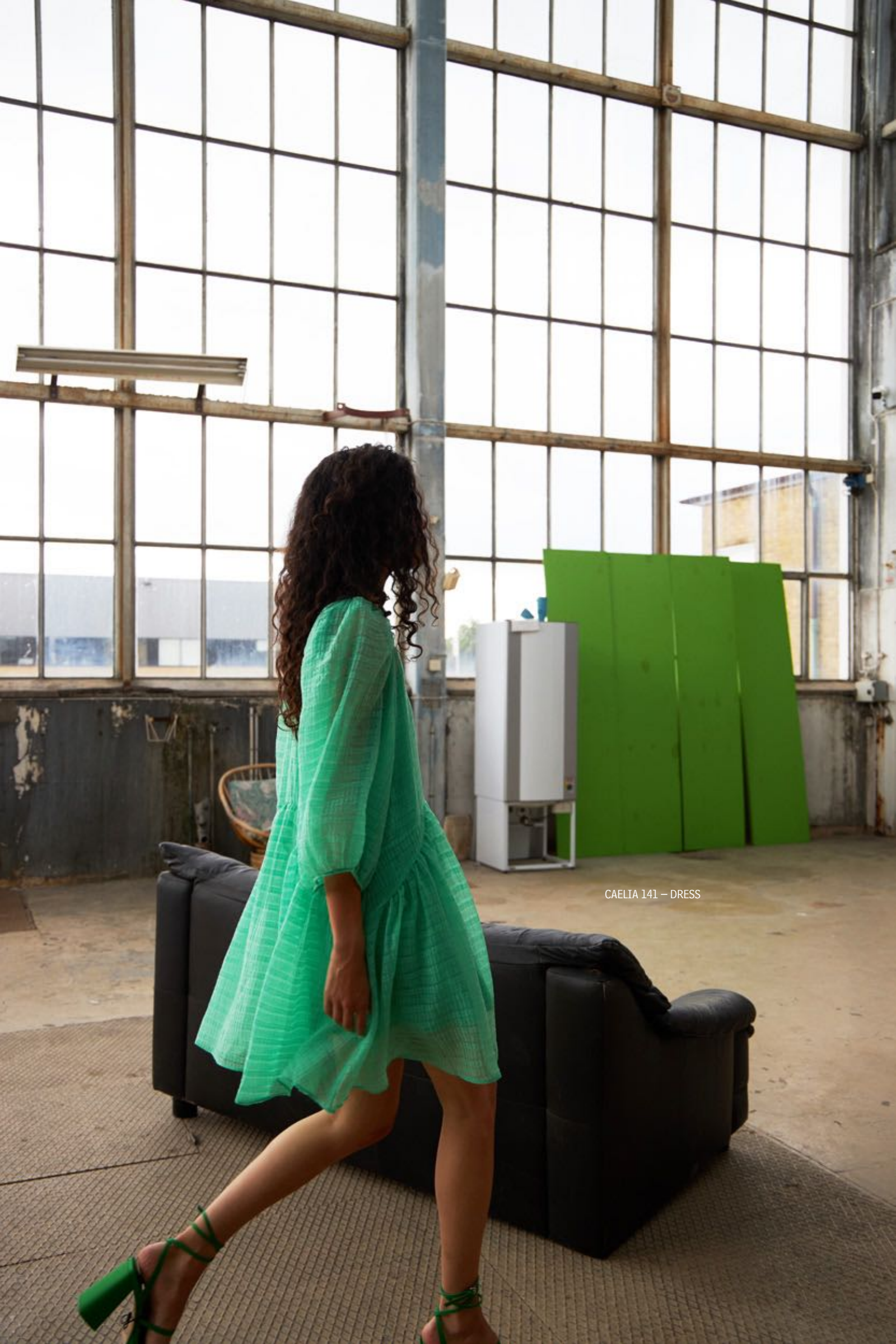
CAELIA 141 – DRESS