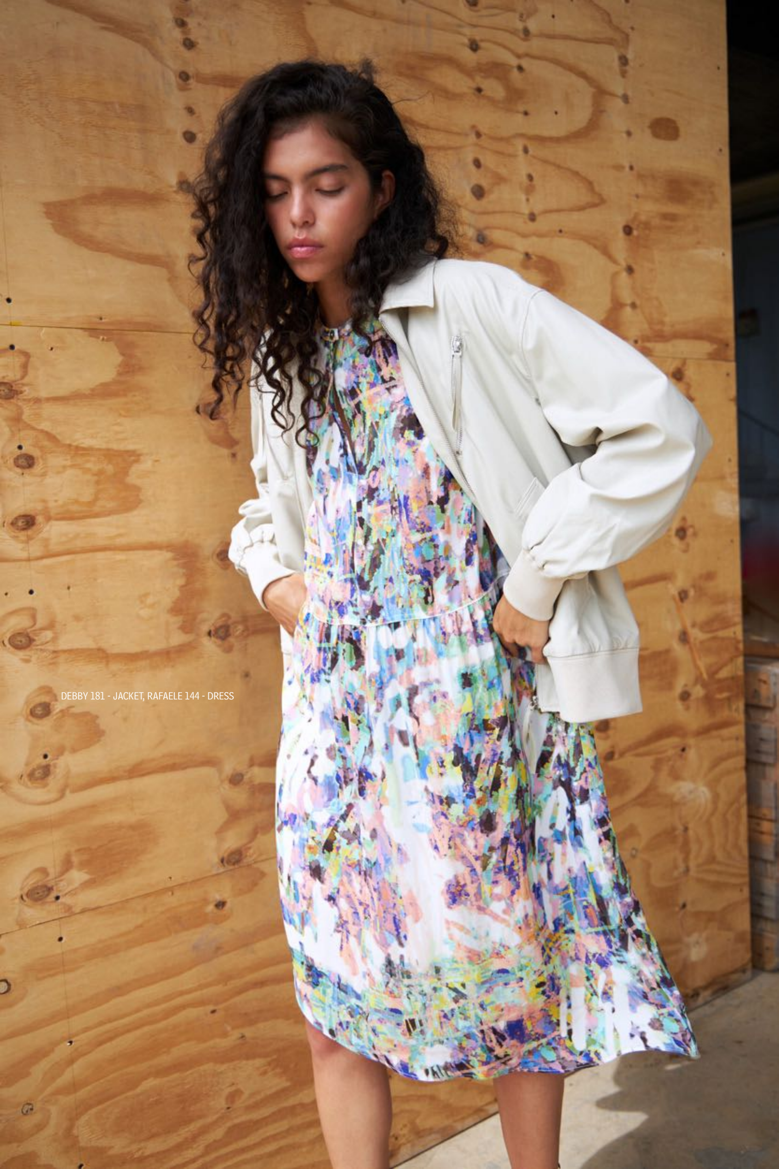
DEBBY 181 - JACKET, RAFAELE 144 - DRESS