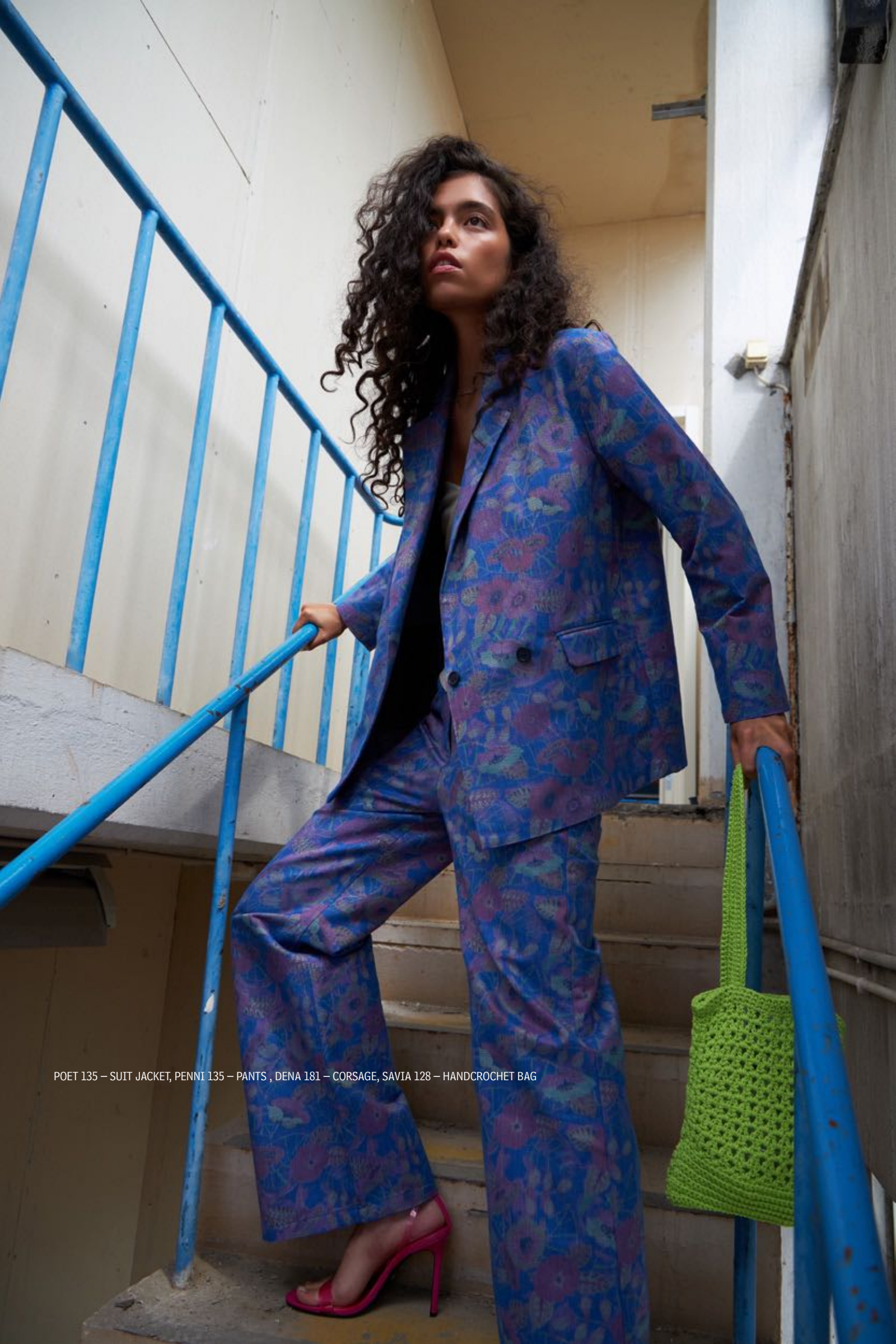
POET 135 – SUIT JACKET, PENNI 135 – PANTS , DENA 181 – CORSAGE, SAVIA 128 – HANDCROCHET BAG