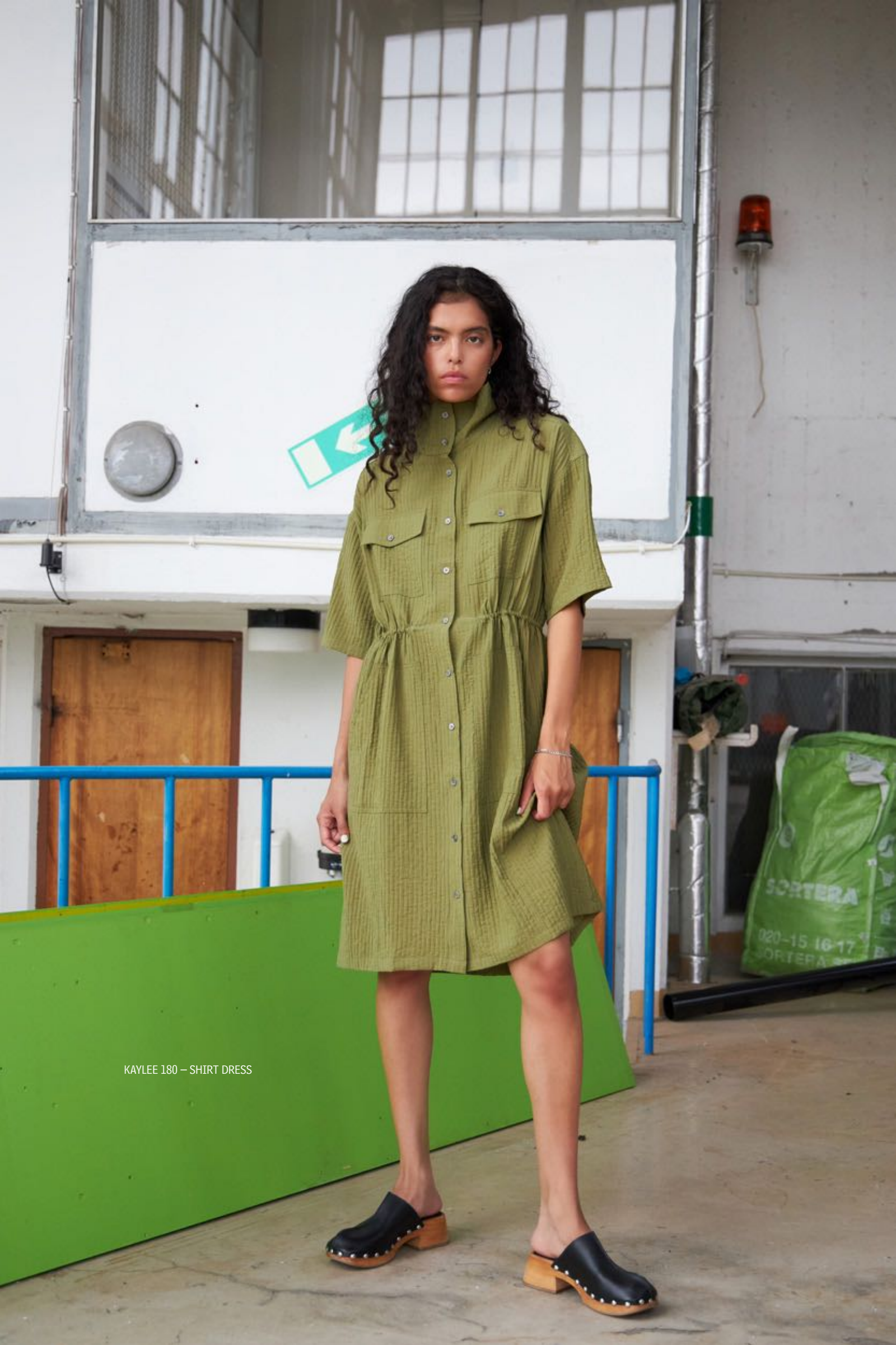
KAYLEE 180 – SHIRT DRESS