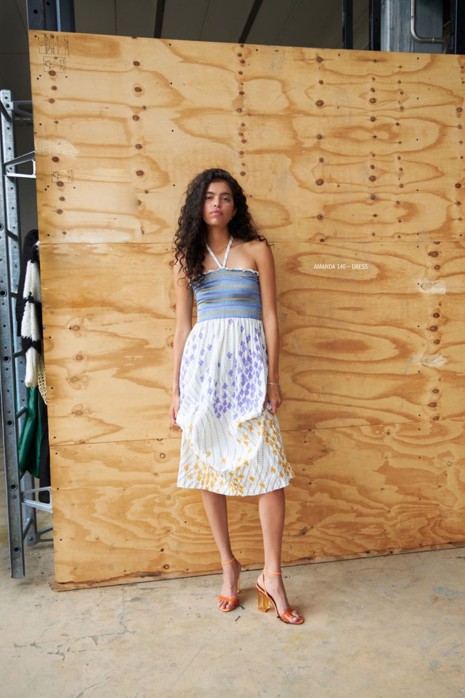
AMANDA 140 – DRESS