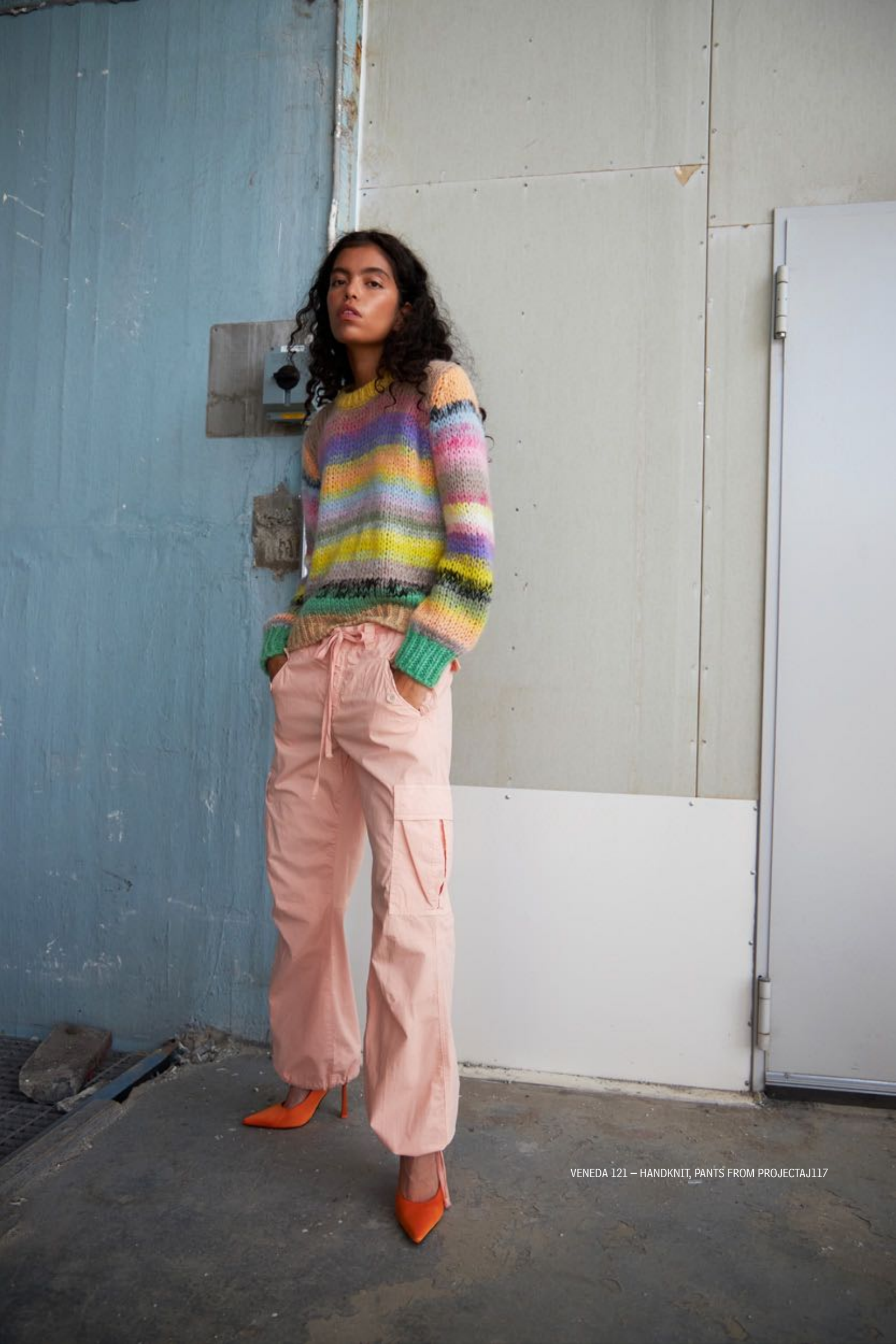
VENEDA 121 – HANDKNIT, PANTS FROM PROJECTAJ117