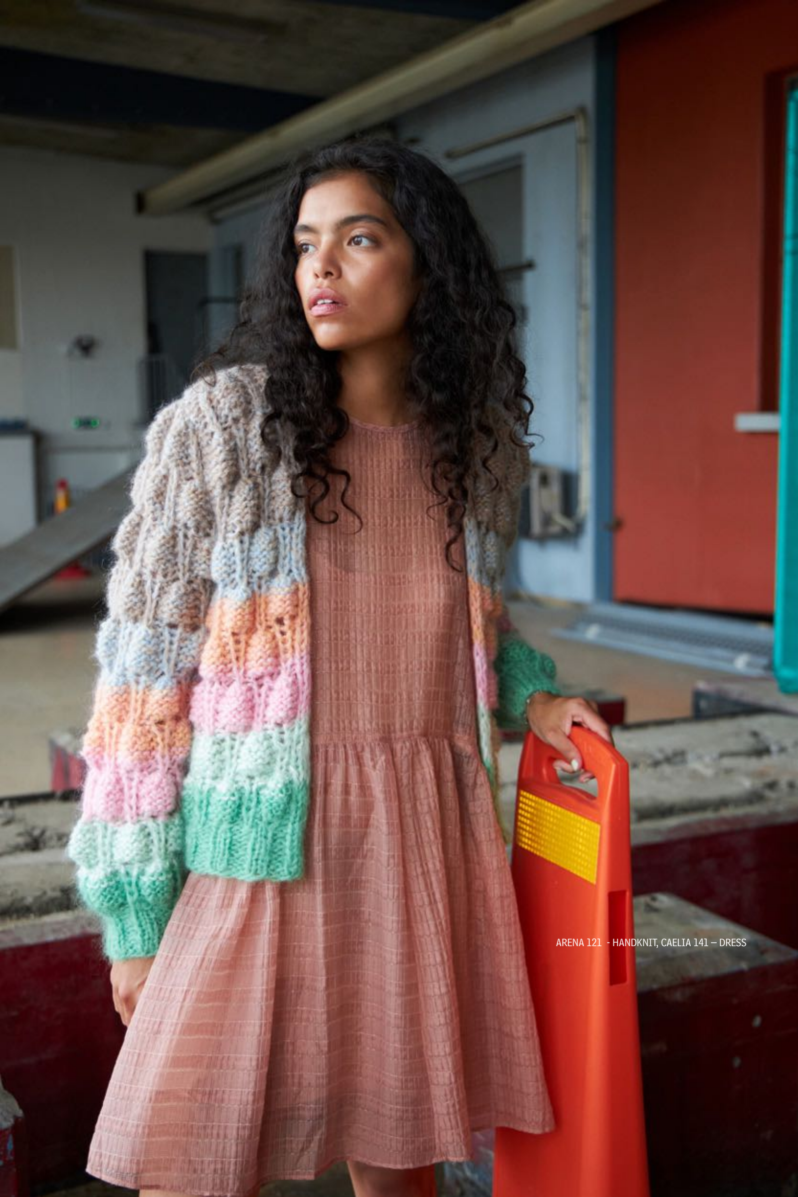
ARENA 121 - HANDKNIT, CAELIA 141 - DRESS