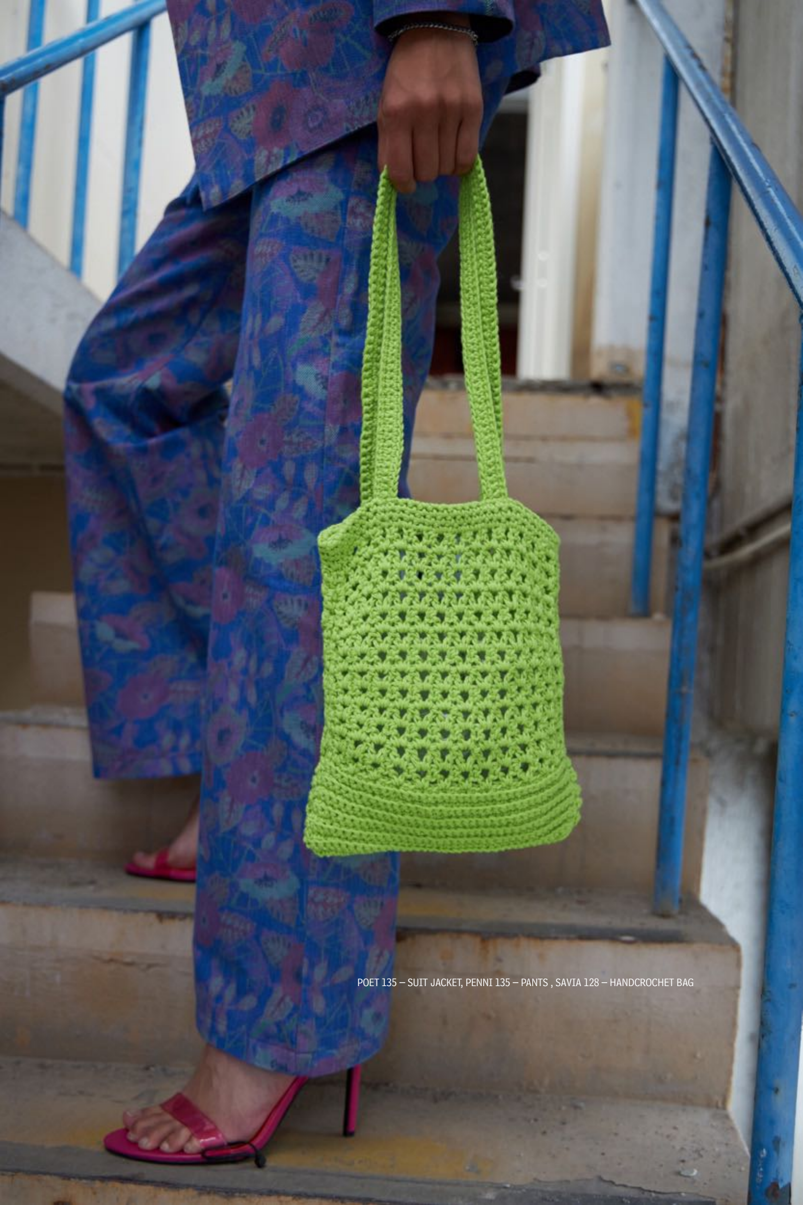
POET 135 – SUIT JACKET, PENNI 135 – PANTS , SAVIA 128 – HANDCROCHET BAG