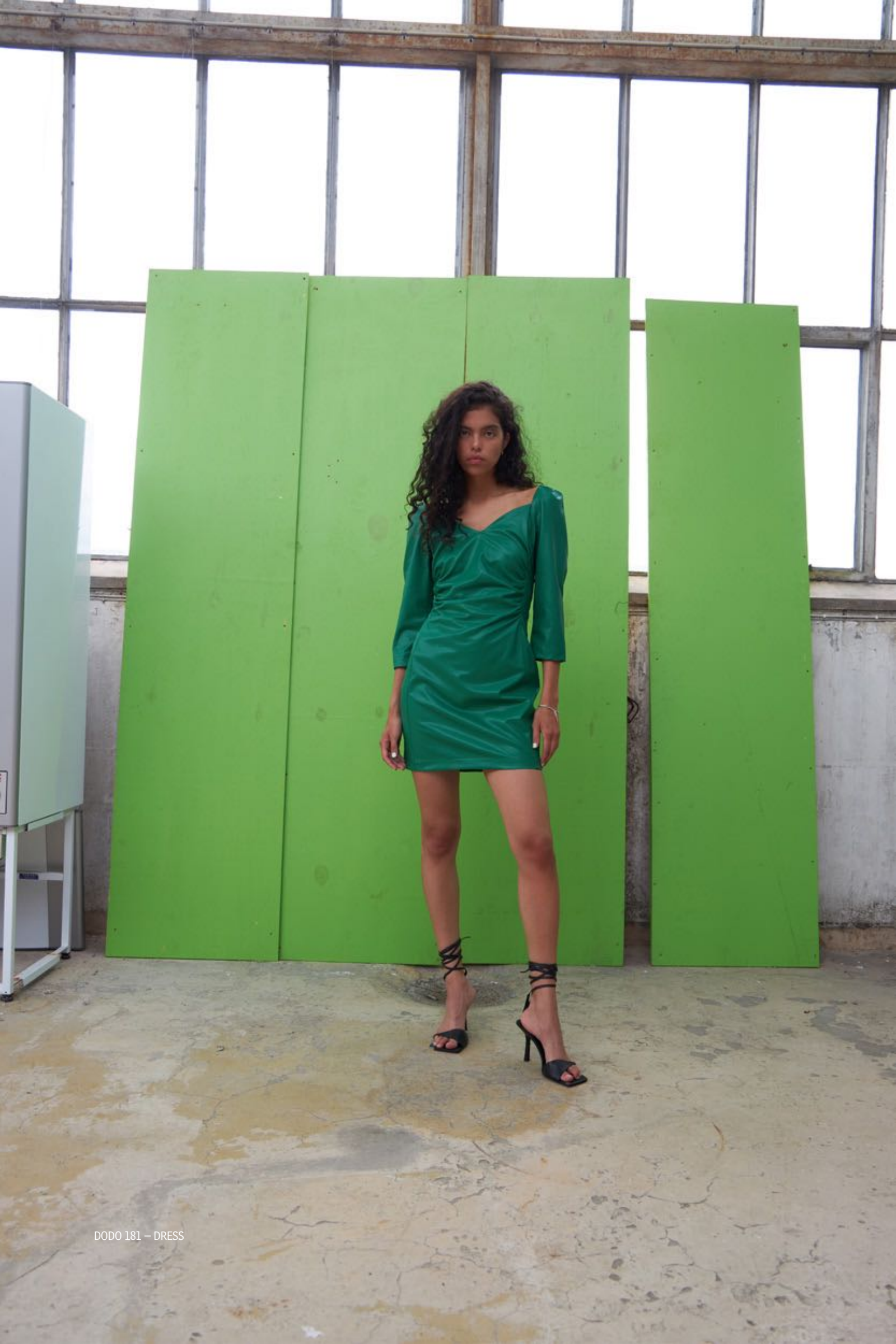
DODO 181 – DRESS