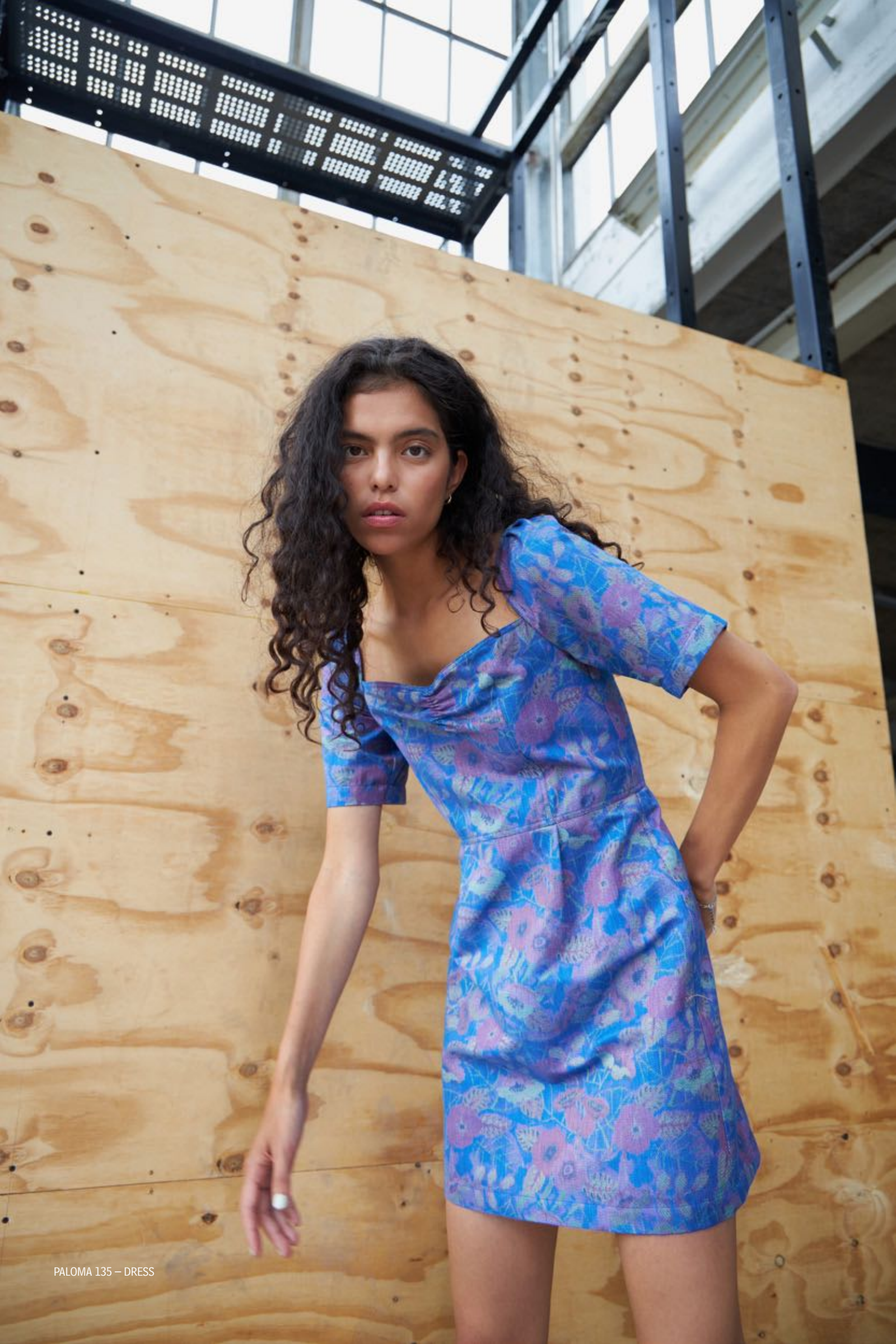
PALOMA 135 - DRESS